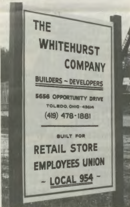
More Construction Pictures on Page 6

POSTMASTER: Send address changes to: Rapportier 730 Summit St., Toledo, Ohio 43604