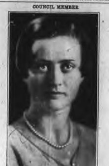
See How the Freshman Women Represent