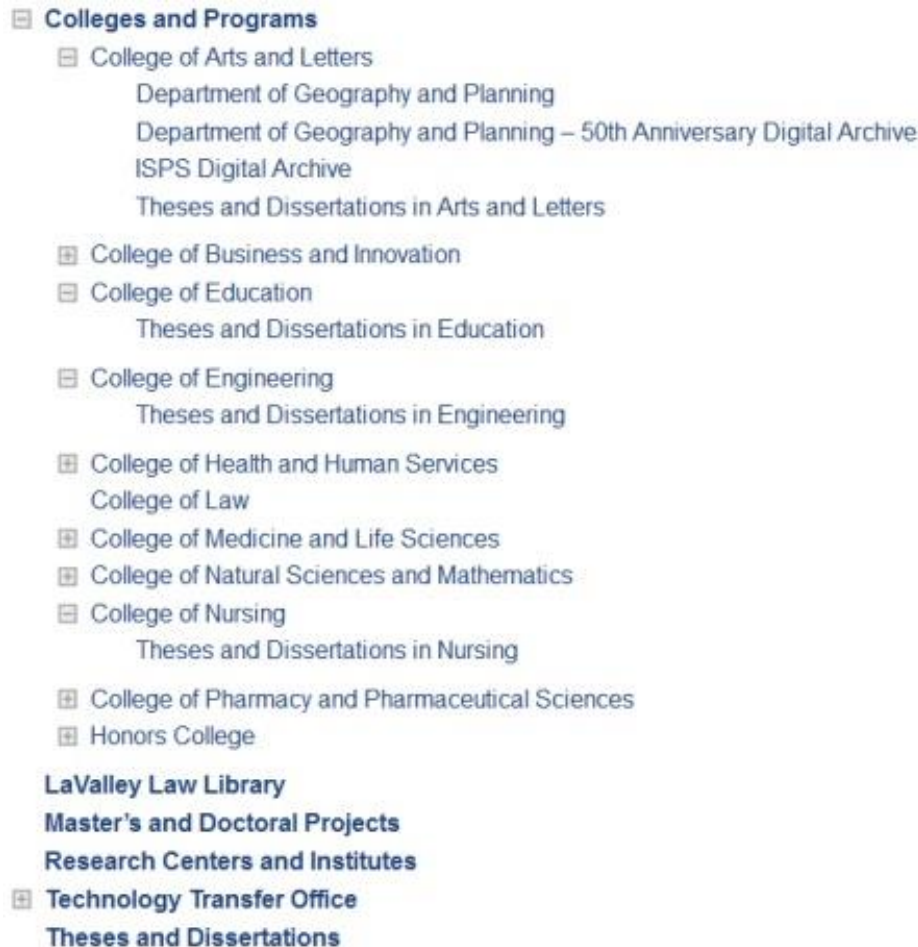
Figure 4. Electronic Theses and Dissertations

This curation strategy does not result in duplicate content, and improves the repository's information architecture by improving navigation through the collection (see Figure 4).