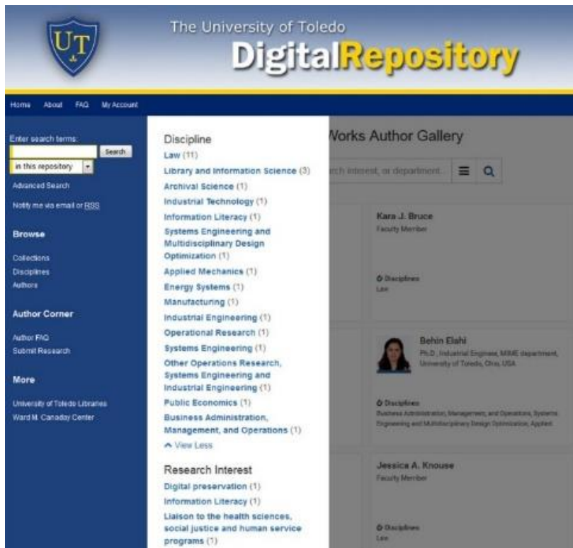
Figure 6. SelectedWorks Interface in the IR

fulfills the promise of the Faculty Publications Database by providing a means for showcasing faculty research and allowing for discovery by potential collaborators and funding bodies. A liaison librarian at UT is currently in discussions with the campus Office of Government Relations to encourage the use of SelectedWorks and the Expert Gallery to fulfill its mission in forging and maintaining valuable partnerships between UT and local, state, and federal governments and public agencies.